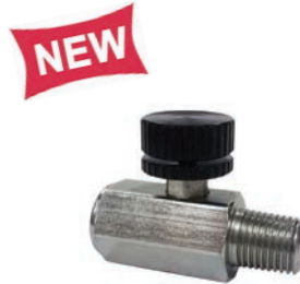
Adjustable Snubbers / Gauge Shut-Off Valves