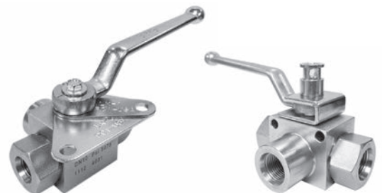
Flat & "U" Style Locking Kits

Carbon steel, high pressure ball valves in 2-way, 3-way and multi-way configurations are available from stock. Valves are rated at pressures up to 7250 PSI. Add-on locking kits are available.