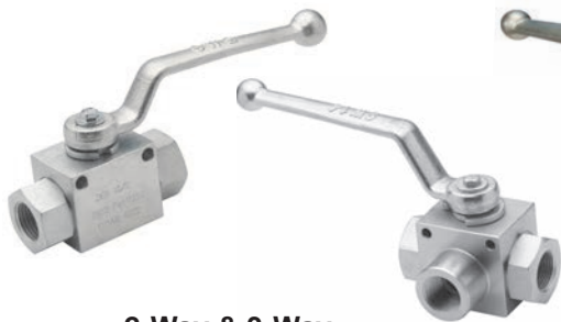
2-Way & 3-Way Mounting Holes Standard