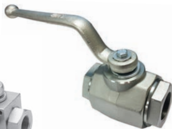
Forged Body 1.5" - 2" Full Port