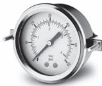
Steel over Brass Dry Gauges