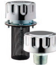
Filter Filler & Screw-In Breathers