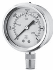
Stainless over Brass Glycerin-Filled