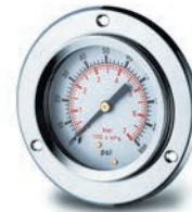
All Stainless Steel Glycerin-Filled

A full range of dry and glycerin-filled gauges offers pressure ranges from vacuum through 10,000 psi and dial diameters from 1 1/2" through 4". Dual-scale dials, psi and bar, are standard and custom dial faces are available with minimum quantity orders. Gauge protectors, snubbers and certificates of accuracy are also available.