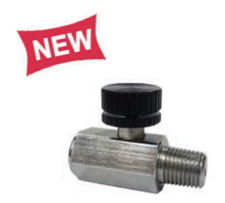
Adustable Snubbers / Gauge Shut-Off Valves