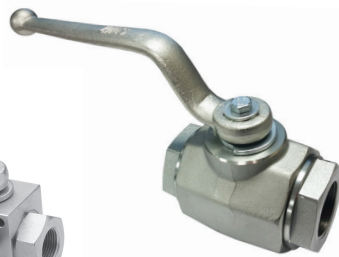
Forged Body 1.5" - 2" Full Port