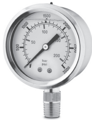
Stainless over Brass Glycerin-Filled