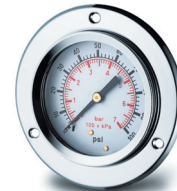
All Stainless Steel Glycerin-Filled

A full range of dry and glycerin-filled gauges offers pressure ranges from vacuum through 10,000 psi and dial diameters from 1 1/2" through 4". Dual-scale dials, psi and bar, are standard and custom dial faces are available with minimum quantity orders. Gauge protectors, snubbers and certificates of accuracy are also available.