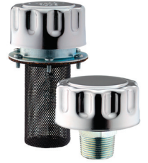
Filter Filler & Screw-In Breathers