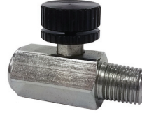
Adjustable Snubbers / Gauge Shut-Off Valves