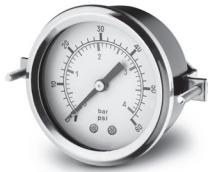
Steel over Brass Dry Gauges