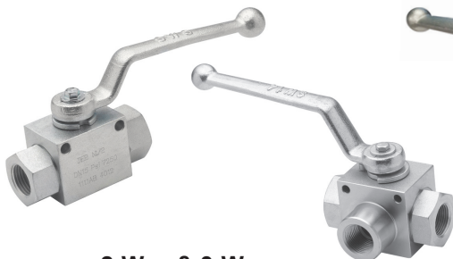
2-Way & 3-Way Mounting Holes Standard